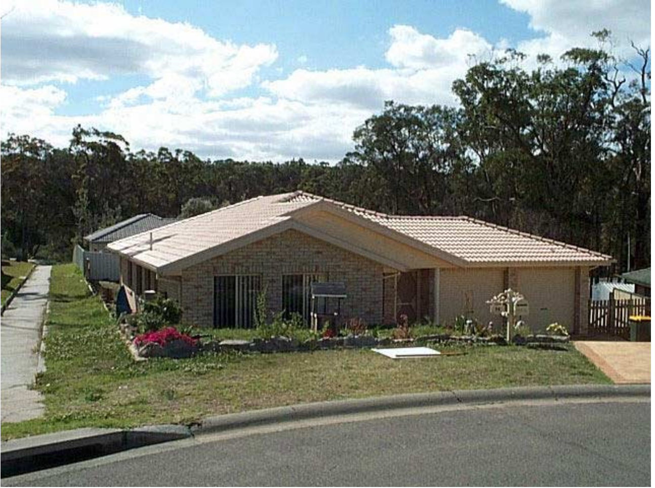
No.14 Sample Close, Toronto.